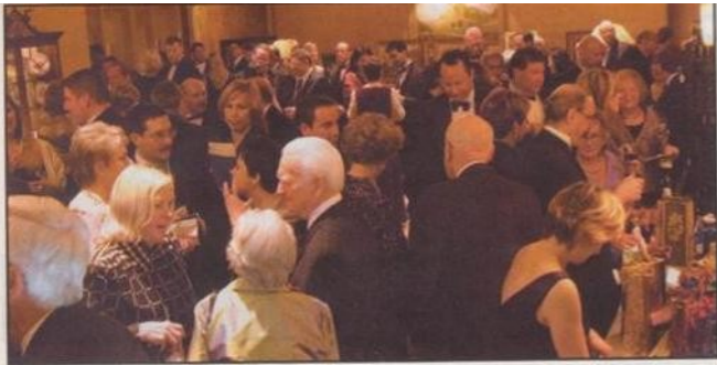
Guests mingle at the Cleveland Hungarian Development Panel's Paprika!